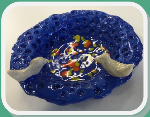
Clay 'bird bath' bowls year 4 and 5 students