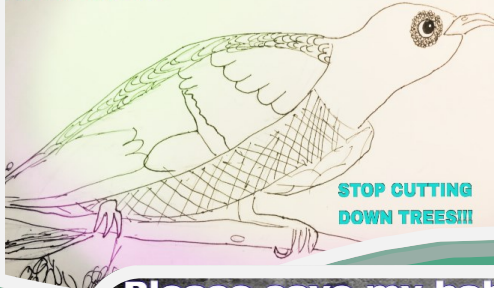
Endangered animal posters – year 3 and 4 students