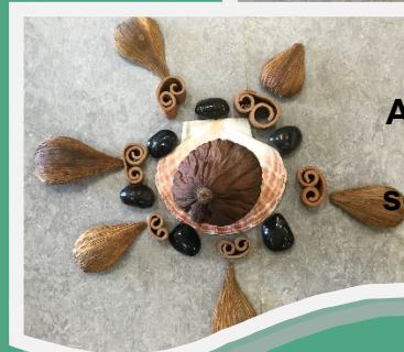
Andy Goldsworthy inspired floor sculptures – year 1 and 2 students