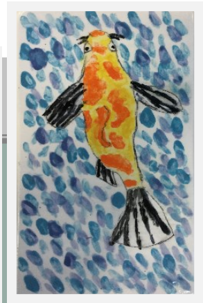
Koi ceramic tiles – year 5 and 6 students